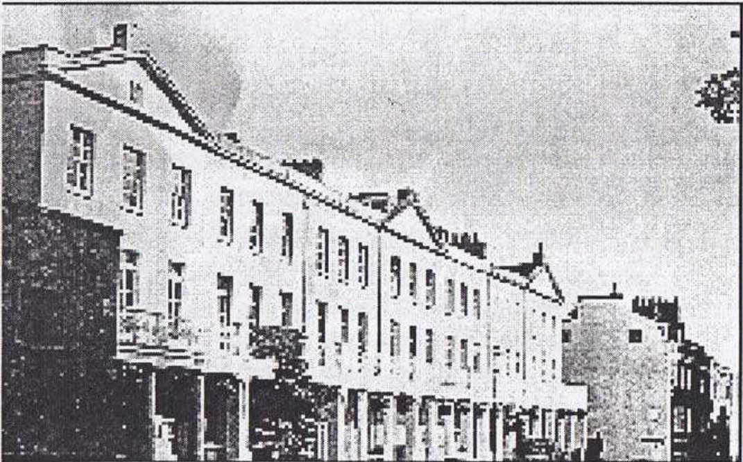
Chichester Place (Now Terrace) Southernhay East.